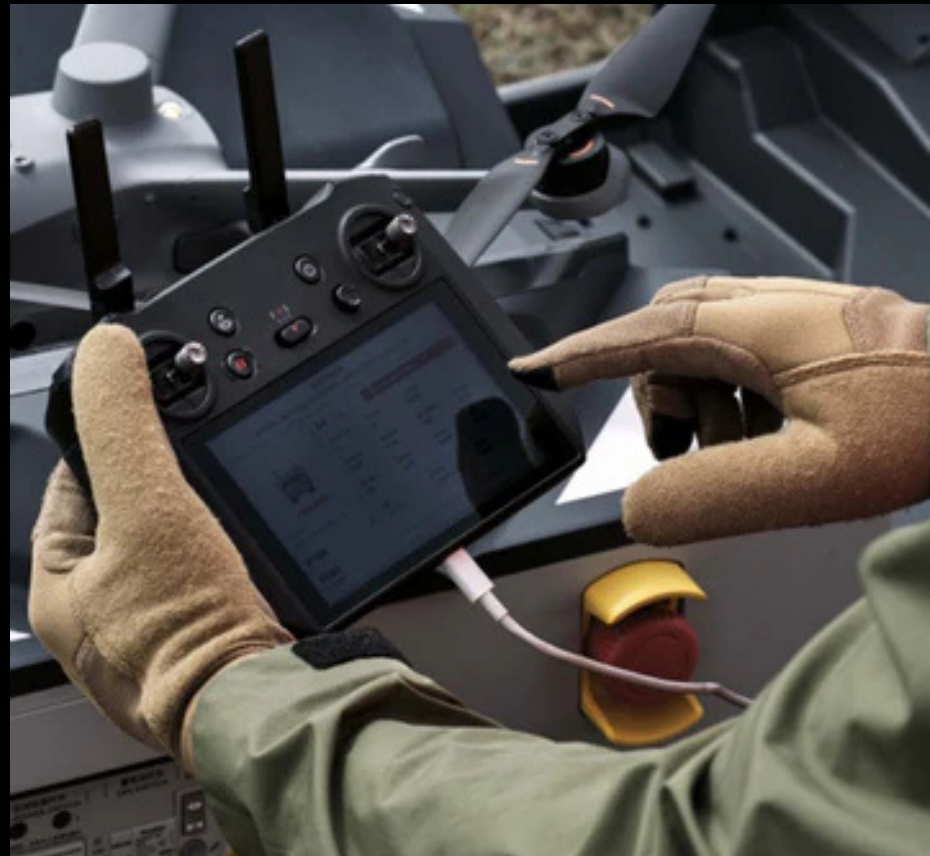
Manually flight capabilities