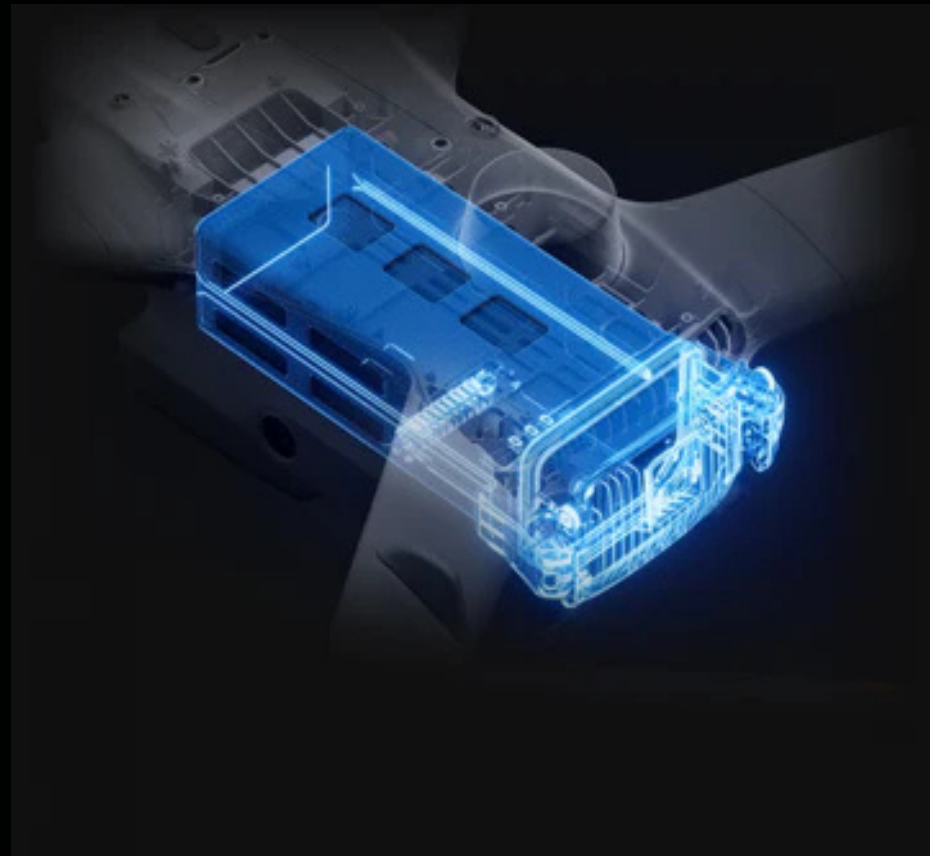
50 minute flight time