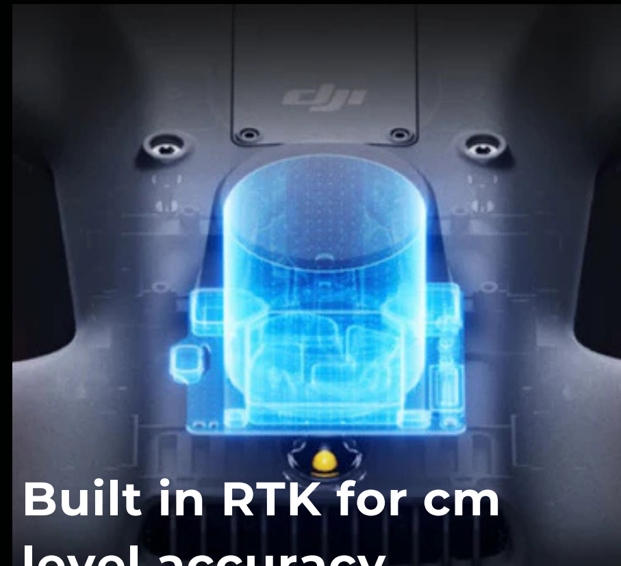
Built in RTK for cm level accuracy